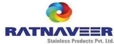
Ratnaveer Metals Ltd.