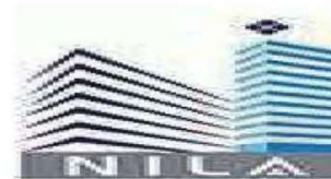
Nila Infrastructure Ltd.